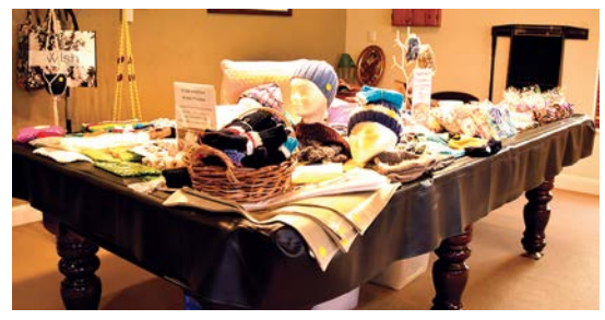
Part of the trading table set up in the Sports Bar.