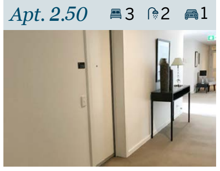
Rare opportunity to secure this spacious 3 bedroom & 2 bathroom Apartment. North East facing.