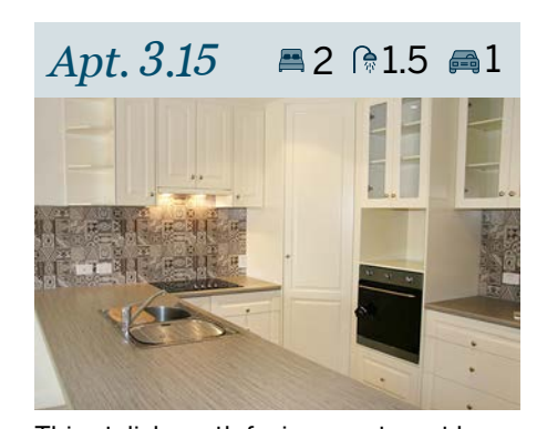
This stylish north facing apartment has a flare of its own. Available now.